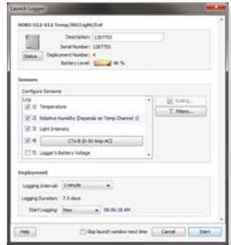
Easy logger setup - select launch parameters and go!

Data assistants – Data Assistants are tools to simplify data analysis specific to your application. Data Assistants are included with HOBOWare Pro, such as Conductivity, Barometric Compensation, Linear Scaling, Pulse Scaling, kWh Assistant, Growing Degree Days, and Grains Per Pound.